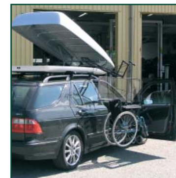
The wheelchair is being loaded from the right side.

Thanks to the low weight (47 kg unloaded) you have a choice of most vehicle makes and models. Bear in mind that the roof box adds 42 cm to the vehicle height above roof rack if you have a garage door height limit to consider.